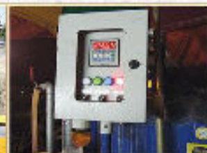
Materials Quantity Quality Control 4