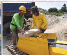
Loading Materials 3