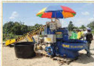
Setup Machine 1