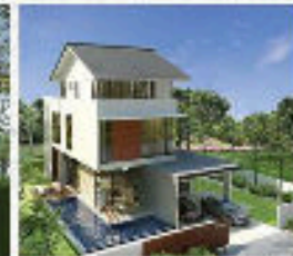
BUNGALOW & SEMI-D