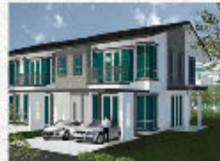
TERRACE / LINK / HYPERLINK