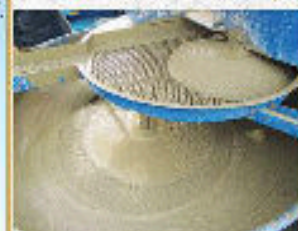
Filter object & big particle sizes to prevent pump blockage 6