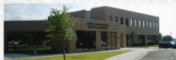
UNIVERSITY & SCHOOL