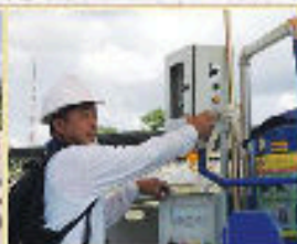
Program & Setting materials formulation 2