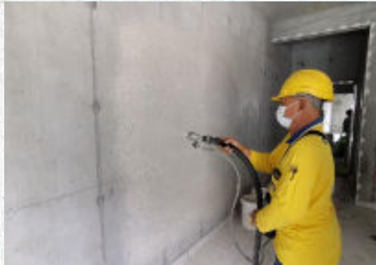
USER FRIENDLY Smart Operating System