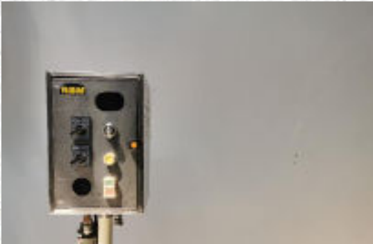
AUTO-OPERATION ON/OFF PUMP