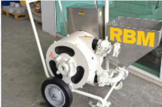
COMPACT DESIGN Multi-function