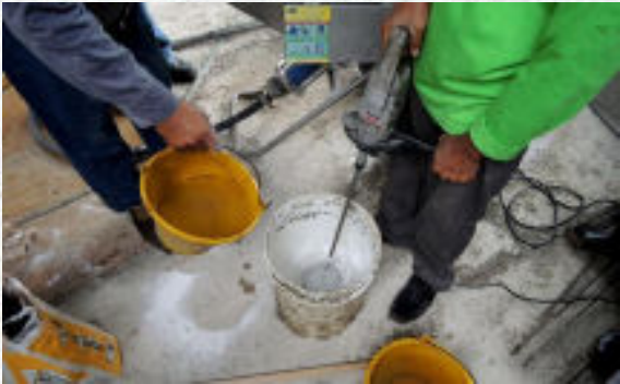
REDUCE LABOURS 3 General Workers